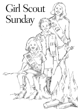
Girl Scout Sunday

We are hoping to be visited by the mayor of Southfield and other city officials plus representatives from our participating food banks. May God continue to richly bless our endeavors.